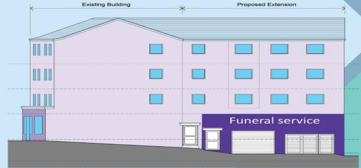
Proposed Side Elevation to Wyndham Street

*Photos and images used are for illustration purpose only